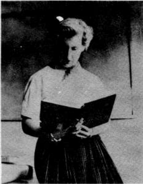
Peace and Quiet of the Library