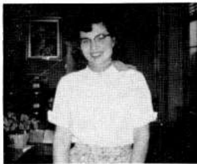
Teacher of the Month