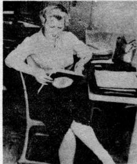
6th Period at Last